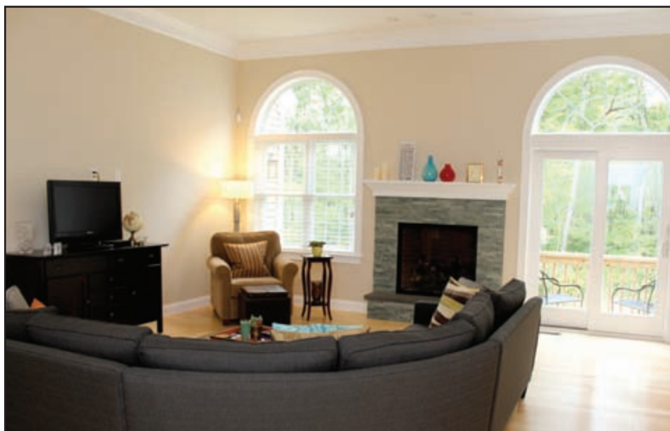
The open living room, above. Patrick Sarkisian demonstrates the ease of fold-out windows.