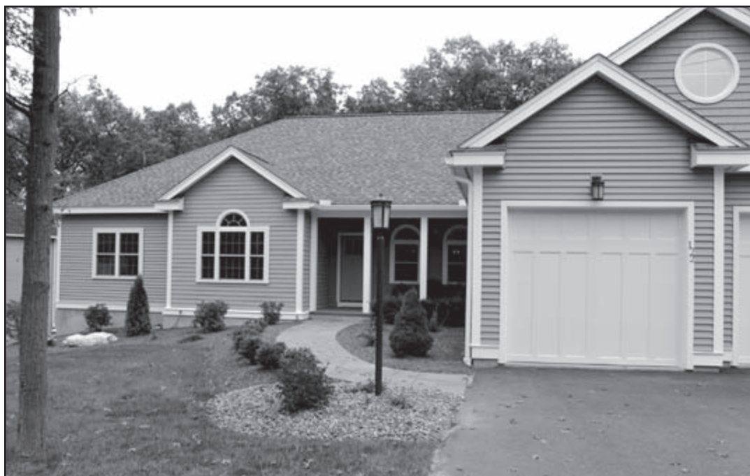
The exterior of the home built with the future in mind.